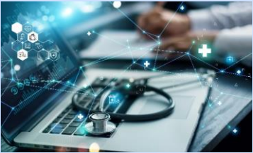
Inflationary & regulatory pressure; supply chain disruption