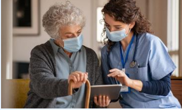
Shift to alternate, non-acute sites of care