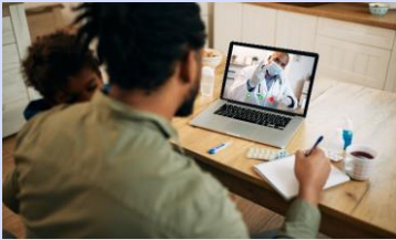
Acceleration of trends by COVID-19 pandemic