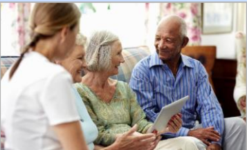
Demographics and an aging population