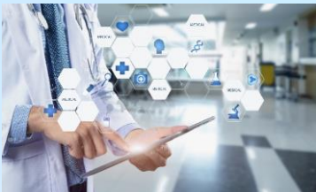
Digital and digitization in care