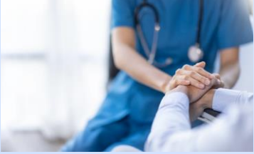
Value based care