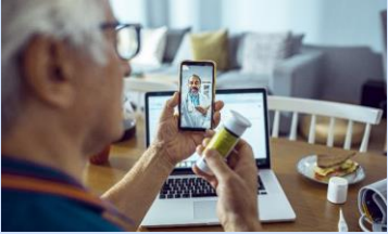
Retailization and outsourcing of care